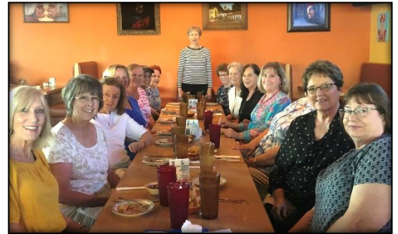
A past gather of Sisters of JOY at Que Bueno