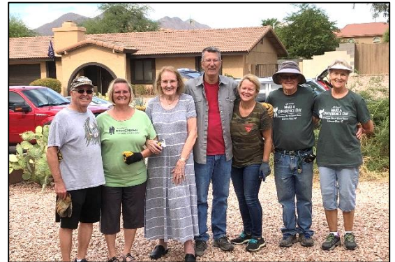
Make a Difference Day 2020

Please contact Geoff Sharp, JOY's project lead You can send an email to Geoff via JOY Church's email JoyChurchAZ@outlook.com